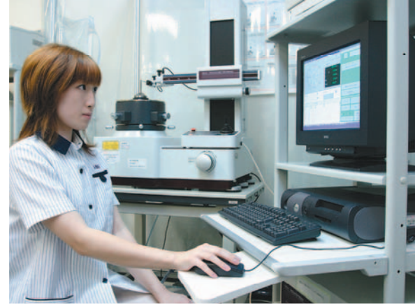
真円度測定機 Roundness test instrument

IMI Corporation, while pursuing the precision on every work it does by employing the best advanced production system, is totally committed to quality assurance programs to ensure the constant quality of all our products. The Company's motto is "Consistent quality." On top of the various kinds of measurement devices and inspection system incorporated in the production lines, which are a matter of course, we put a very stringent quality inspection system in place on each of a manufacturing process. These careful qualities check systems attribute to forging our customers' confidence and trust of the long standing of the Company.