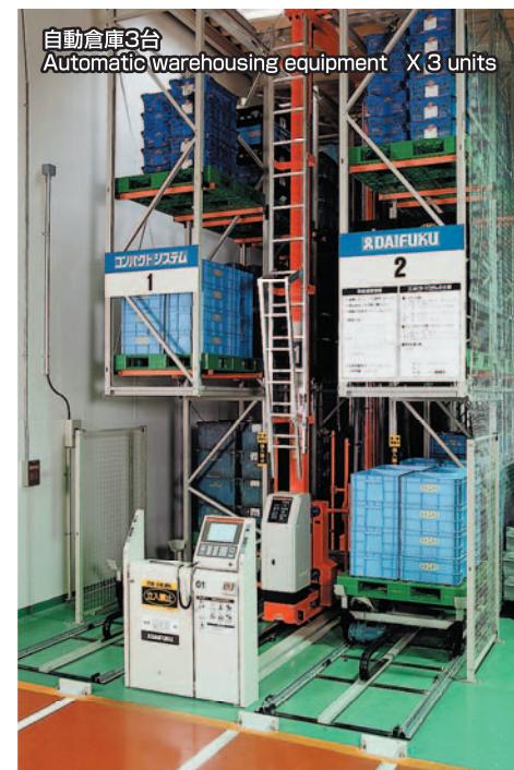
自動倉庫3台 Automatic warehousing equipment X 3 units