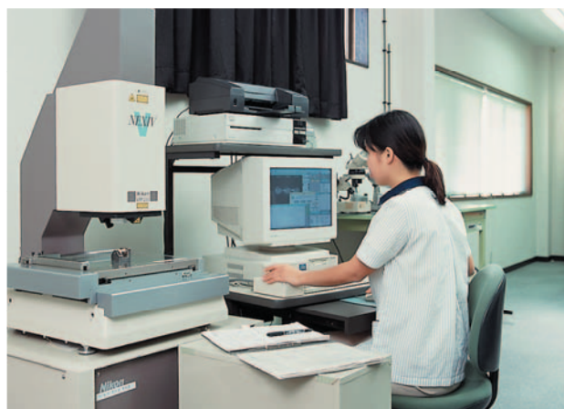
CNC画像測定システム CNC image measuring system