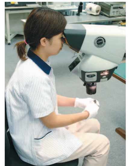
マンティスビジョンシステム Mantis vision system