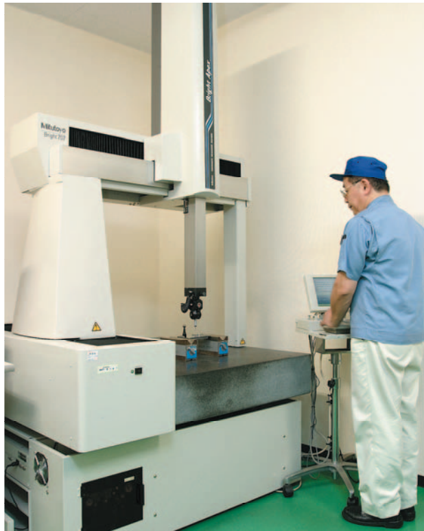
三次元測定器 Cordinate measuring machine